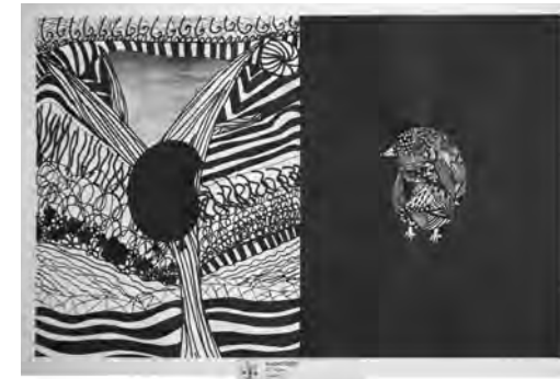
Isabel Salter - Black and White Bird

The Bloomington Park District Museum & Art Gallery art exhibition will run through Saturday, April 8. The Bloomington gallery is located on Bloomington Road and Franklin Street in Bloomington. For gallery times, please call 630-539-3096.