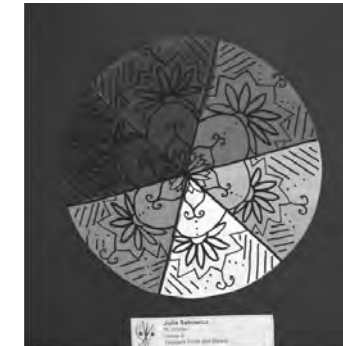
Julia Sakowicz - Color Wheel